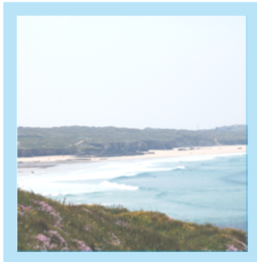
PERFECT DAY